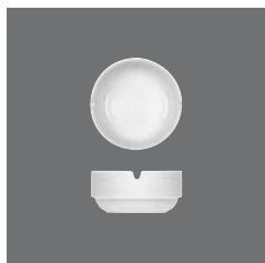
Ascher rund , Ashtray round, Cendrier rond, Cenicero redondo, Posacenere rotondo

> Pfefferstreuer 55 4020 5529 - 47 (1.85) 69 60