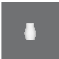
Pfefferstreuer , Pepper shaker, Poivrière, Pimentero, Spargi pepe

> Pfefferstreuer 55 4020 5529 - 47 (1.85) 69 60