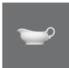
Saucenschälchen , Sauce-boat small, Saucière petite, Salsera pequeña, Salsiera