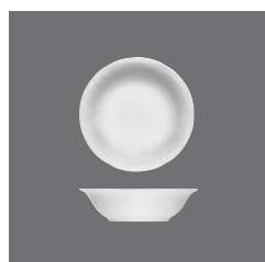
Salatiere rund , Salad dish round, Saladier rond, Ensaladera redonda, Insalatiera rotonda