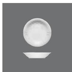
Kompottschale rund , Fruit saucer round, Compotier rond, Compotera redonda, Coppetta rotonda