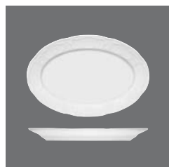
Platte oval Fahne , Platter oval with rim, Plat ovale à l'aile, Fuente oval con ala, Piatto ovale