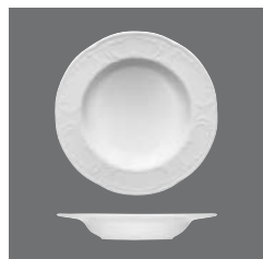
Teller halbtief flache Fahne , Plate half-deep with flat rim, Assiette demi-creuse à l'aile plate, Plato hondo con ala plana, Piatto semifondo