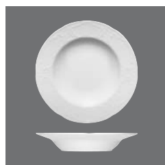
Teller tief steile Fahne , Plate deep with steep rim, Assiette creuse à l'aile relevée, Plato hondo con ala empinada, Piatto fondo con falda alta