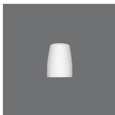
Pfefferstreuer , Pepper shaker, Poivrière, Pimentero, Spargi pepe

> Salzstreuer 90 4010 9028 - 53 (2.09) 69 85