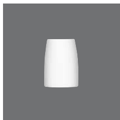
Leuchter , Candleholder, Bougeoir, Candelabro, Candeliere

> Pfefferstreuer 90 4020 9029 - 51 (2.01) 68 85