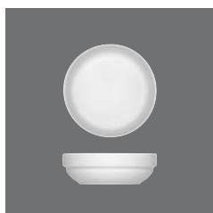
Kompottschale rund , Fruit saucer round, Compotier rond, Compotera redonda, Coppetta rotonda

> Kompottschale rund 12 90 3062 9085/12 0,27 (9.13) 120 (4.72) 40 / 215 195