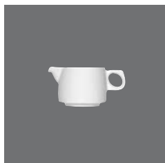
Saucenschälchen , Sauce-boat small, Saucière petite, Salsera pequeña, Salsiera

> Kompottschale rund 12 90 3062 9085/12 0,27 (9.13) 120 (4.72) 40 / 215 195