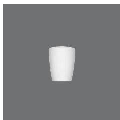
Salzstreuer , Salt shaker, Salière, Salero, Spargi sale

> Sauciere 0.30 90 3830 9075/0.30 0,30 (10.14) 143 (5.63) 77 / 370(5) 295