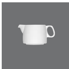
Sauciere , Sauce-boat, Saucière, Salsera, Salsiera

> Saucenschälchen 0.10 90 3810 9077/0.10 0,10 (3.38) 112 (4.41) 56 / 265(5) 155